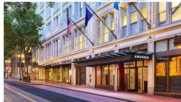
The Nines Hotel