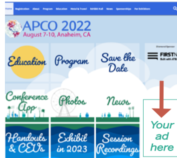
Example is from APCO 2022 website.

$1,500/per email - attendee reach (registered attendees & exhibitors)