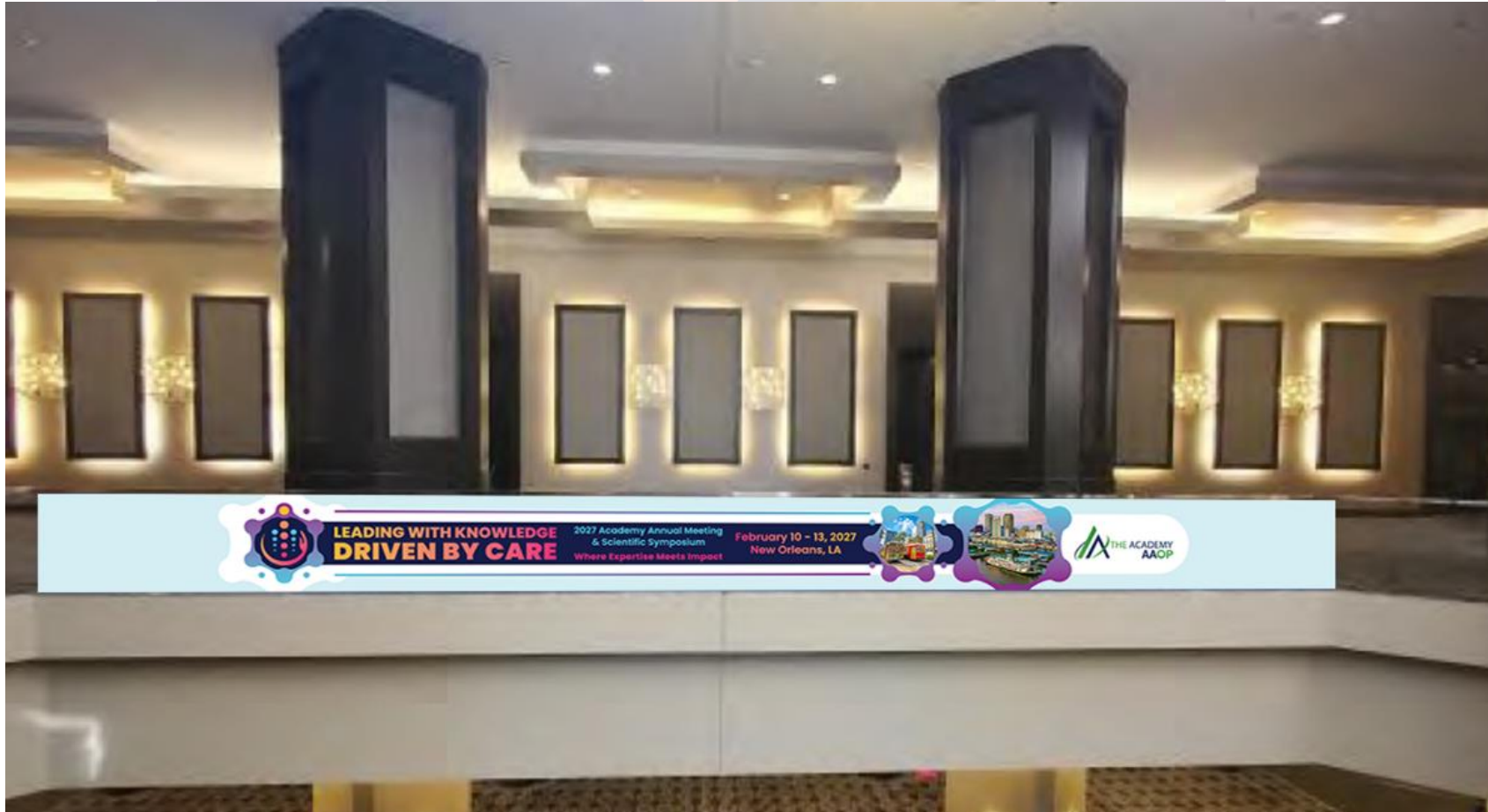
Celestine Foyer Railing Cling