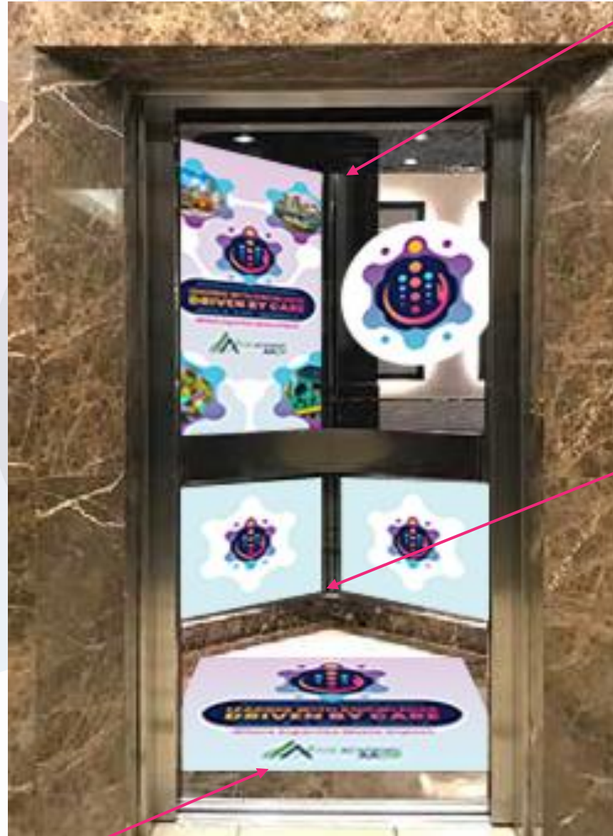
Elevator Window Graphics Top