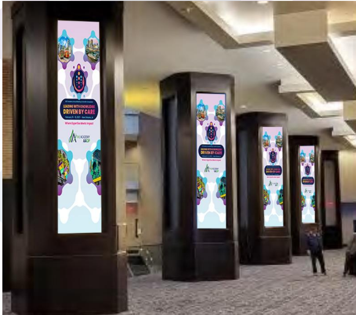
Celestine Foyer Column Clings