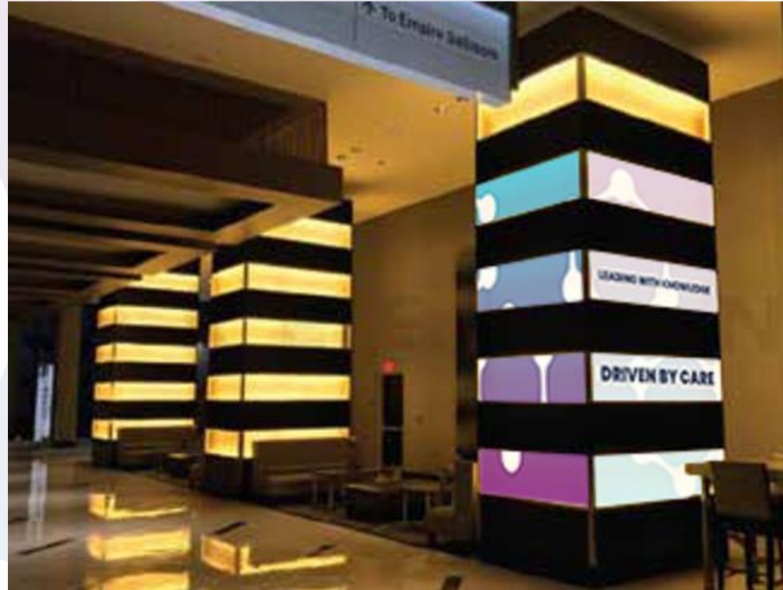
Back-lit Column Panels