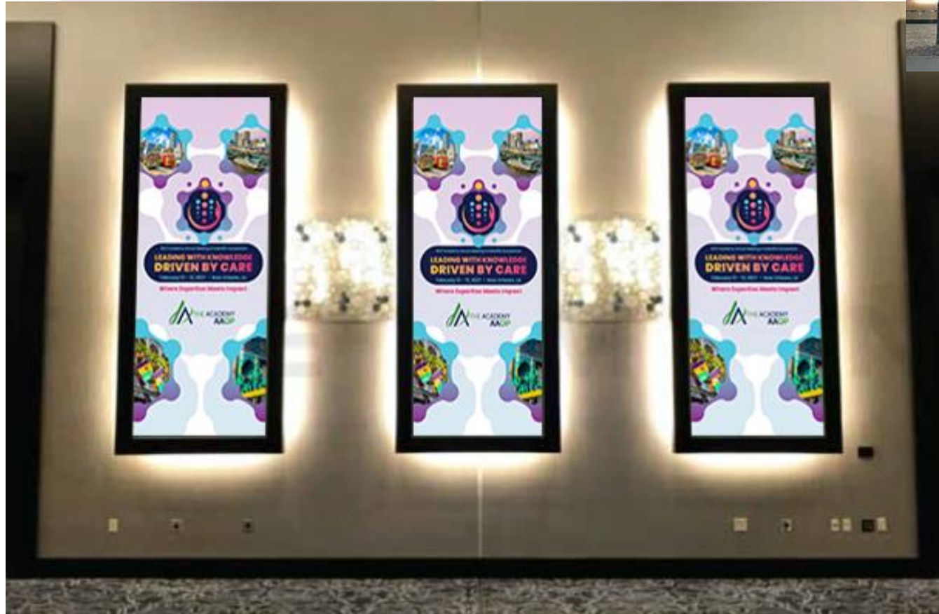
Back-Lit Wall Graphics (Set of 3 Clings)