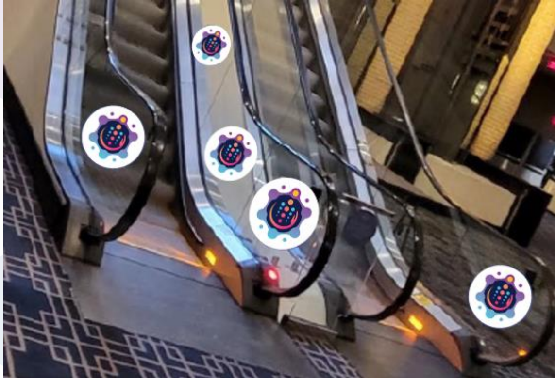
Two Story Escalator Cling Climb (60 Clings)