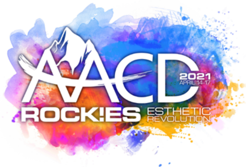
EXHIBIT CONTRACT >CLICK HERE